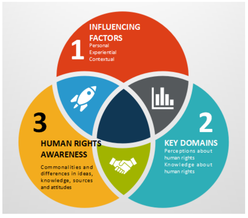
Figure 1. Framework for analyzing human rights awareness among undergraduates developed by the researchers

There are three modifying factors that influence students' views: personal, experiential, and contextual.